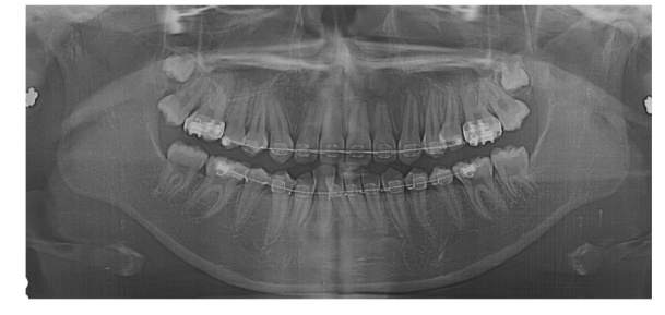
Fig. 7 Forty-eight months after marsupialization

Conservative treatment appears to be preferable in the younger age groups because it offers a better quality of life; however, the recurrence rate remains high [1]. Therefore, during surgical treatment after marsupialization, careful attention should be given to removing the tumor by sufficient curettage of surrounding tissues [16]. Moreover, long-term follow-up is important for conservative treatment of UA because >50% of recurrences occur within 5 years of the treatment [1, 19]. Scariot et