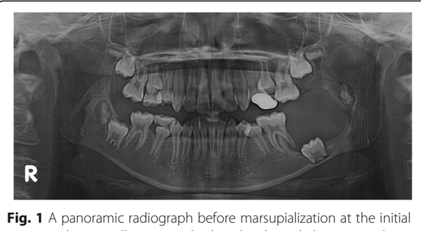
visit revealing a well-circumscribed, unilocular radiolucency in the region of the left mandibular molars, with an unerupted second molar and dental follicle of the third molar

A panoramic radiograph revealed a well-circumscribed, unilocular radiolucency in the region of the left mandibular molars, extending from the distal root of the first molar area to the left ascending ramus, with an unerupted second molar, and the dental follicle of the third molar (Fig. 1). The