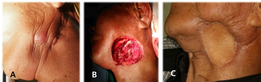
Fig. 3 Reconstruction of skin defect on mandible with the supraclavicular artery island flap in patient 3 (left side). a Skin lesion of 10×9 mm. b Skin defect of 20×20 mm. c Complete healing of recipient site at 4 months after surgery

The common donor site morbidities are tolerable for SCAIF patients. Dehiscence or seroma formation was found in less than 15% of cases in perioperative period [12]. Hypertrophic scars might occur from huge tension along the donor site. If donor site defect is over 10 cm wide, split thickness skin graft rather than extensive undermining should be considered to facilitate wound healing [5, 10]. Limitation of shoulder motion (abduction and external rotation) was found to be less than 20°, which is acceptable to daily living of patients [13].