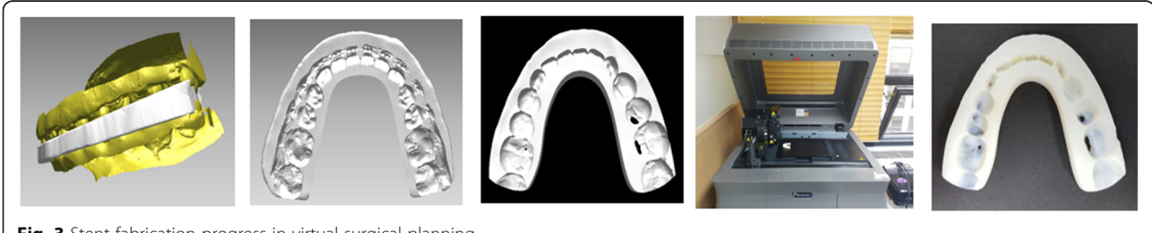
Fig. 3 Stent fabrication progress in virtual surgical planning

A law for the improvement of the residents' training environment and status was recently established in South Korea. The law ensures that residents do not work