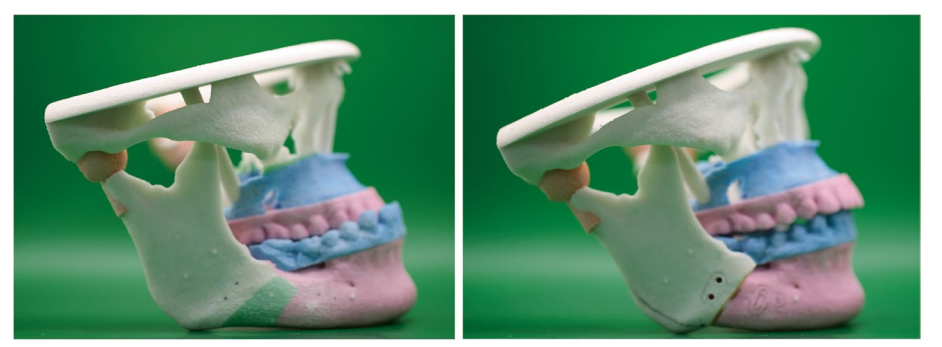
Fig. 3 Portraying a patient-specific rapid prototyping (RP) model, showcasing the preoperative state on the left and the postoperative state on the right. These models are created through the utilization of RP technology, highlighting the practical applications of 3D printing in surgical preparations. The preoperative state, depicted on the left side of the figure, represents the initial condition of the patient's anatomy. Through the RP model, surgeons can accurately visualize the patient's anatomy prior to the surgical procedure. On the right side of the figure, the postoperative state is illustrated. The RP model aids in depicting the desired outcome of the surgical intervention. Surgeons can use the model to simulate the surgical procedure and assess the feasibility of their proposed surgical plan. By comparing the preoperative and postoperative states, surgeons can evaluate the effectiveness of their surgical technique and make any necessary adjustments prior to the actual surgery. This enables them to optimize surgical outcomes and minimize potential complications

(1) Cost: Initial setup and material costs can be high, although these may be offset by time and resource savings in the long run.