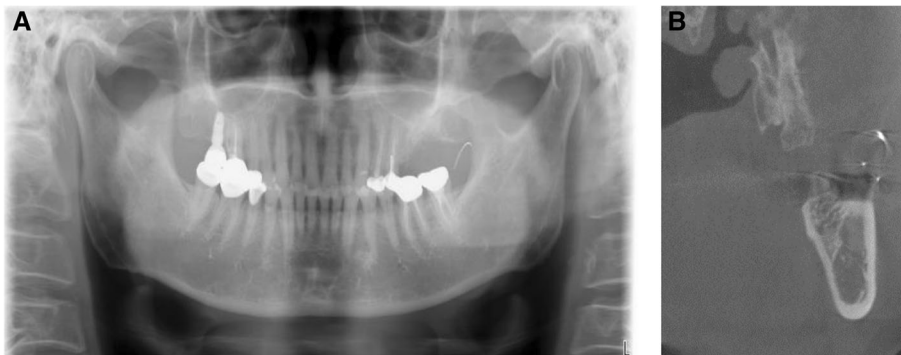
Fig. 2 A Panoramic radiograph taken on arrival shows needle fragment located at the anterior ramus of left mandible. B CBCT image of the lost needle with 2 injection needles as reference points

On the following day, the patient underwent the surgical exploration under general anesthesia. Taking the clinician's information that the initial suture was performed on the left upper second molar region into