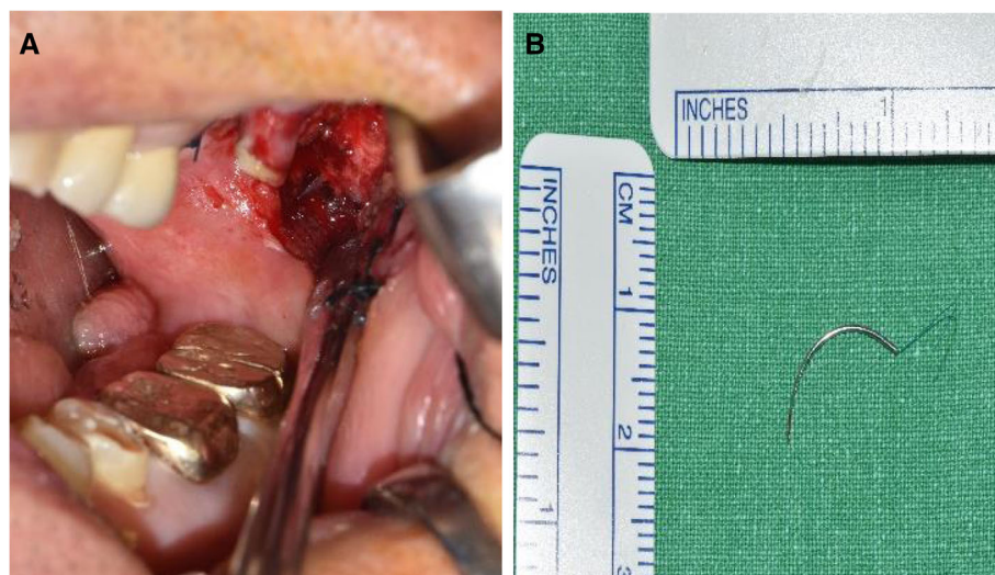
Fig. 3 A A single needle fragment embedded in the buccal mucosa. B The suture needle successfully retrieved

Many reports have described and/or recommended the use of reference needles placed in situ with additional radiographic images taken repeatedly for an effective localization of the needle [5, 8, 9, 11, 15, 16, 18, 24, 36–38]. Thompson et al. [5] reported that the use of two venipuncture needles can be successfully applied as reference needles.